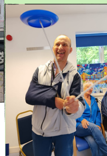
The Flying Seagulls

"I felt nervous coming to Headway Sussex. I needed help from Stroke. I started to come along in June 2023. You helped me to find my confidence. Thank you a whole heaps."