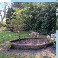
Woodworking: National Trust Sheffield Park Partnership